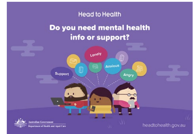
Item 6: Postcard for consumers