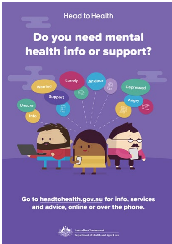
Item 1: Head to Health – Need support poster