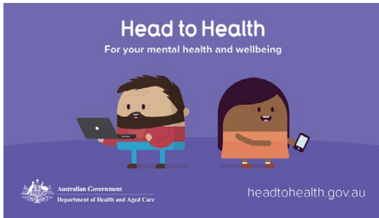
Item 7: Head to Health wallet card