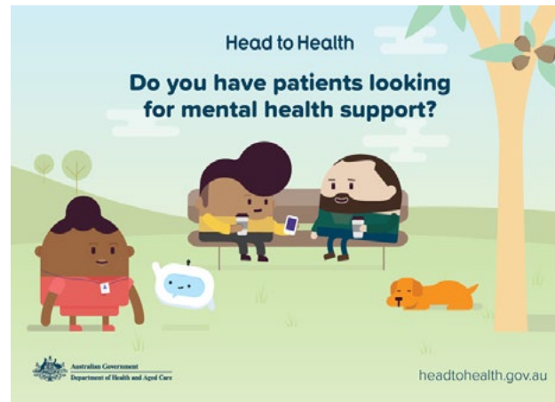
Item 5: Postcard for health professionals